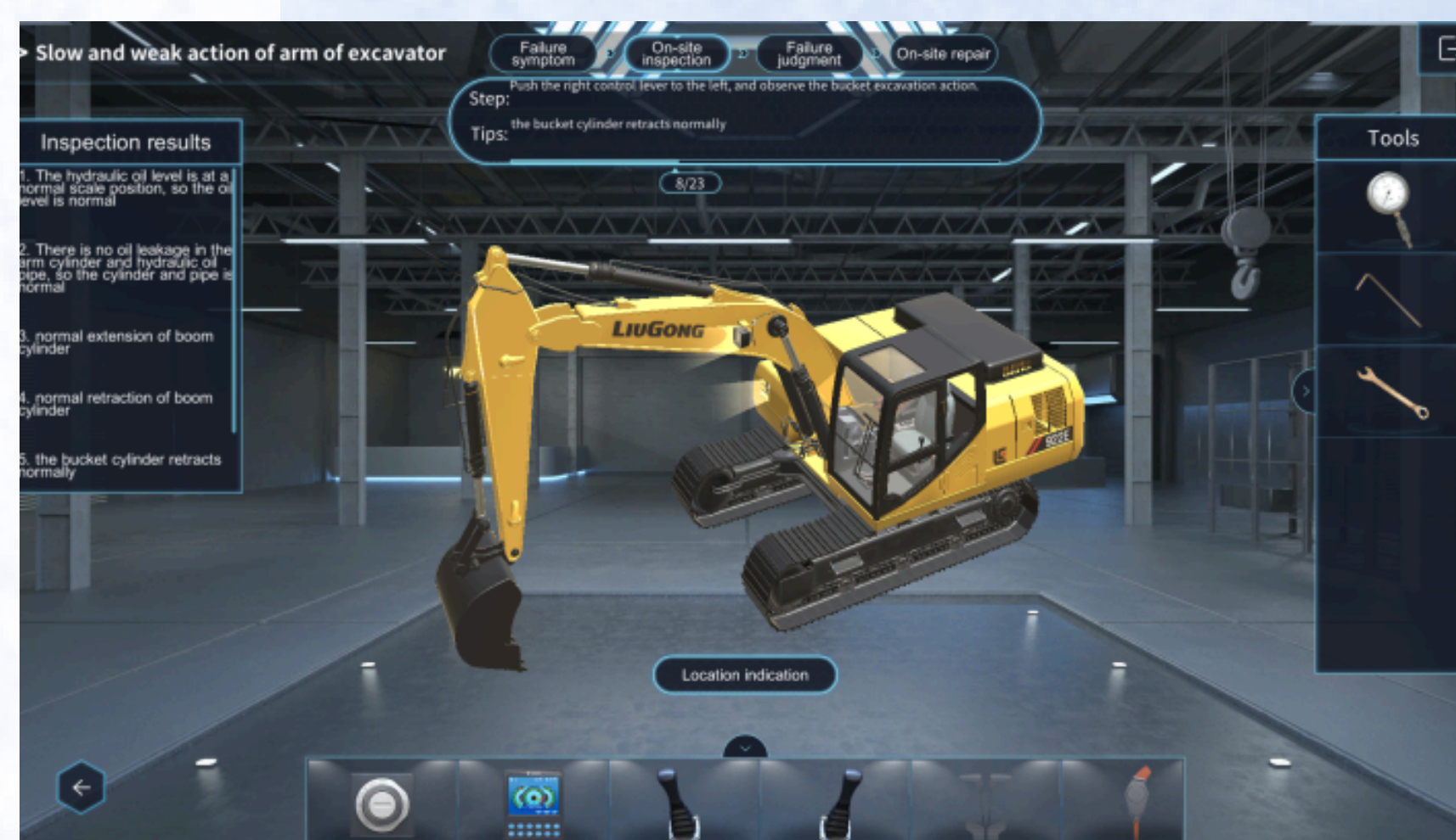
Regarding slow and weak movement of excavator arms, no movement of the entire excavator, inability of the excavator to turn, slow and weak operation of loader arms, etc