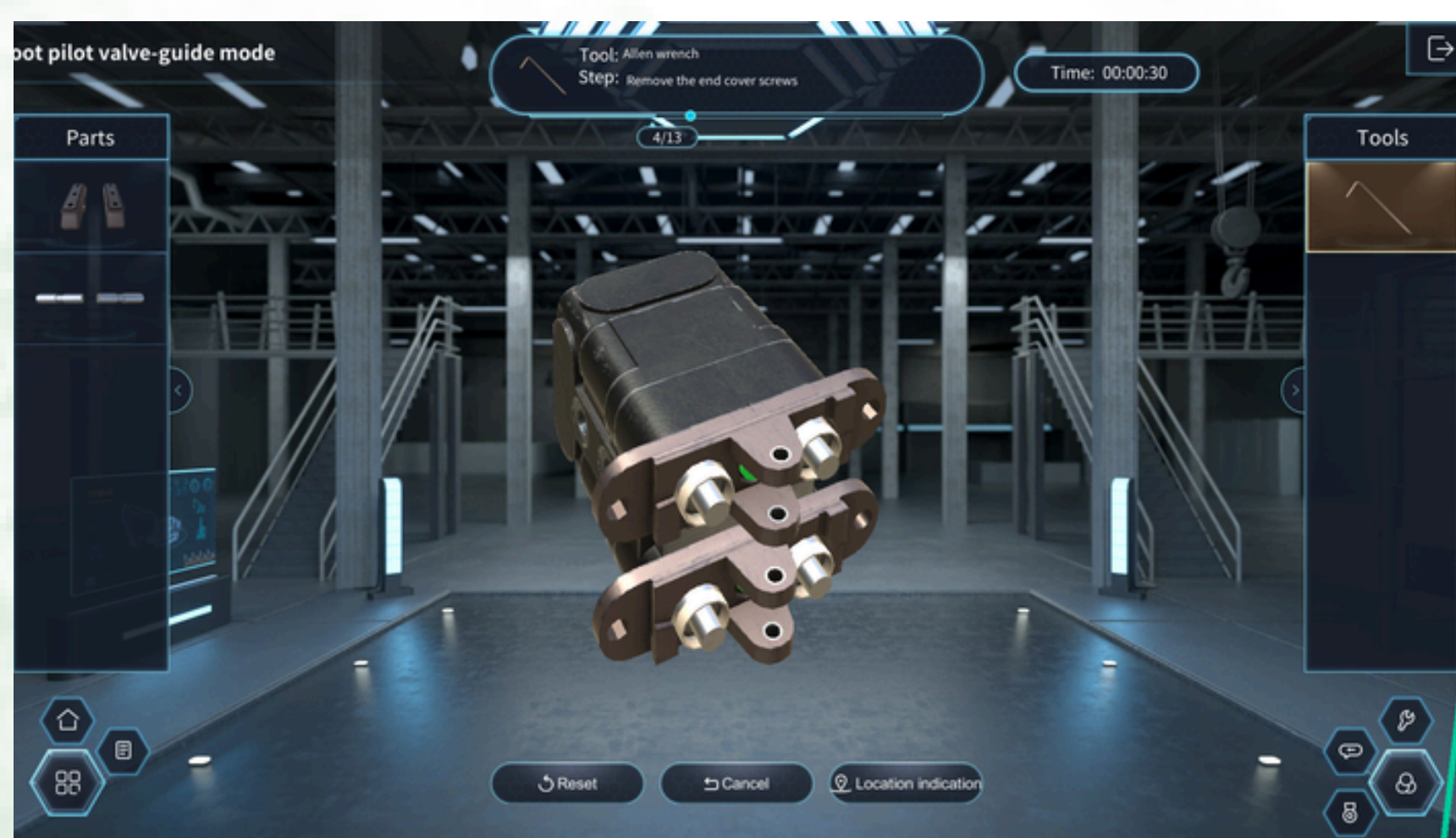
Interactive training exercises on assembly of walking motor, main control valve, manual pilot valve, foot pilot valve, rotary center, rotary motor, and main pump