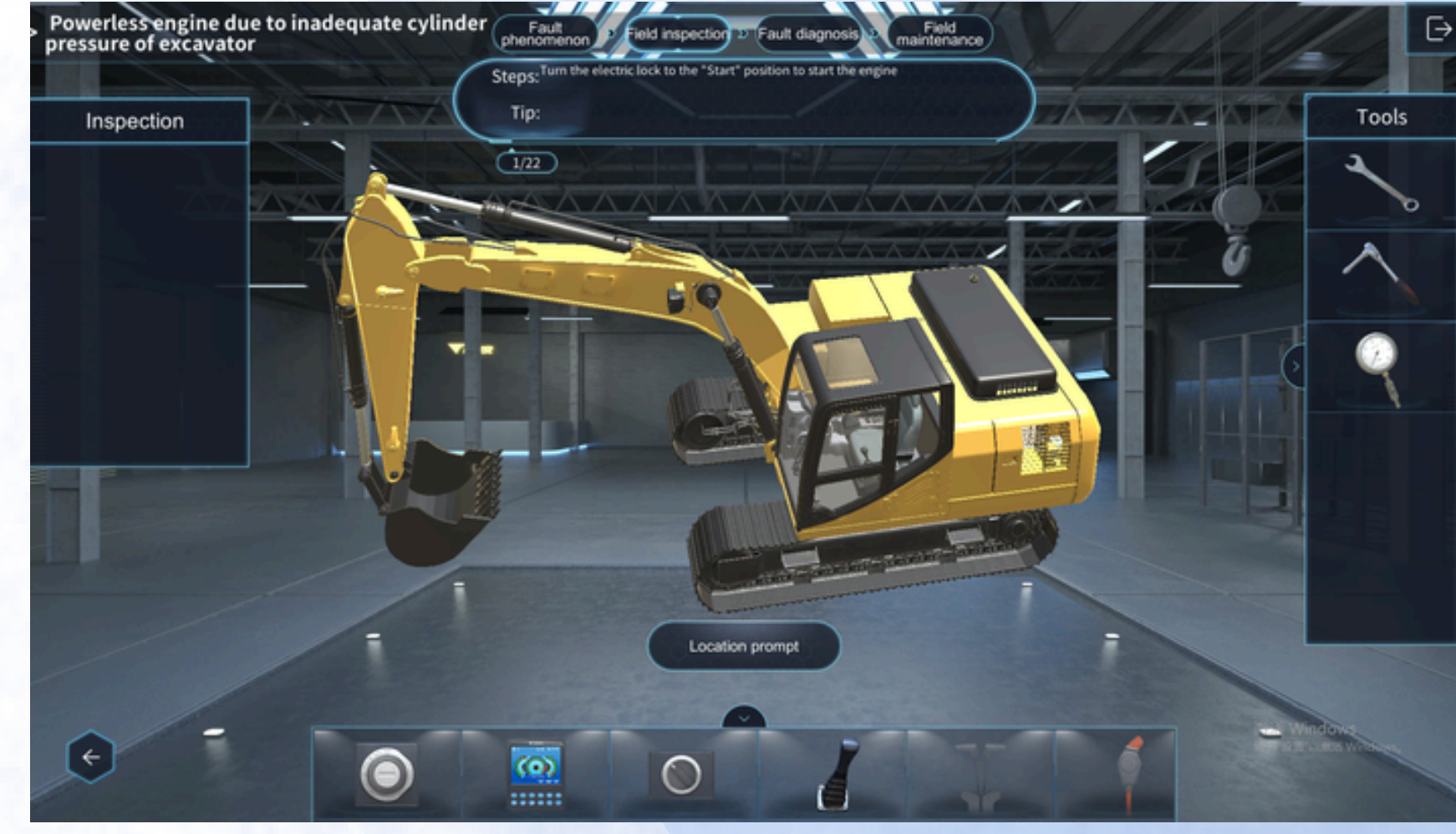
Interactive training exercises on excavator engine belt looseness leading to high engine coolant temperature and engine oil combustion caused by damaged loading oil ring