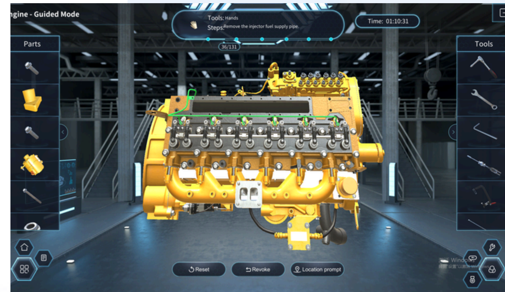
Interactive training exercises on disassembly and assembly of construction machinery engine